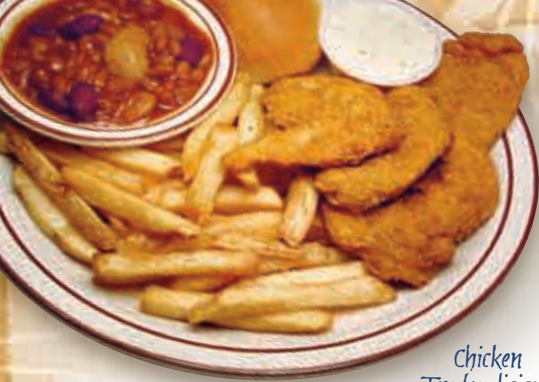
Chicken Tender-licious Strips