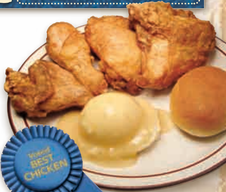
Half Broasted Chicken

Mary's award-winning Broasted Chicken. 7.99