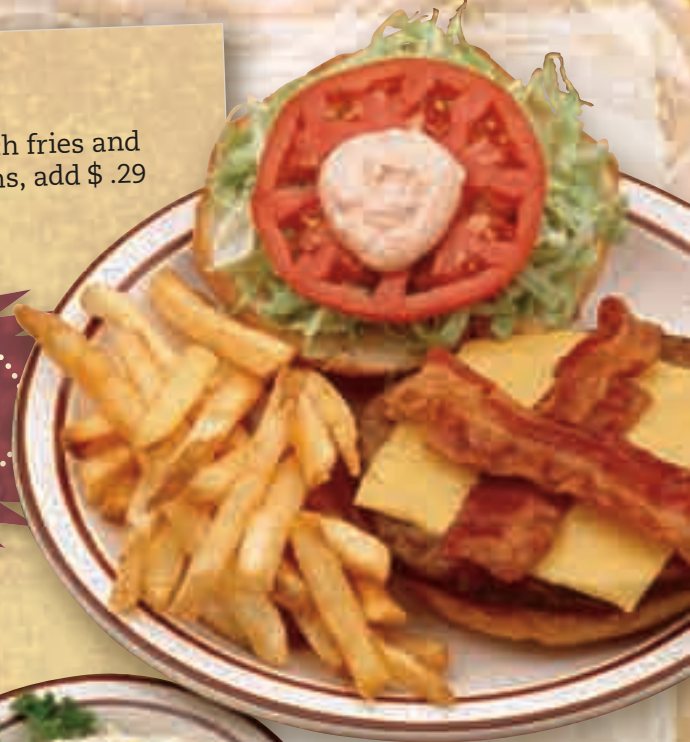
Fox Cities Original Bacon Cheeseburger

Topped with American or Pepper Jack cheese, two strips of bacon, lettuce, tomato and special sauce 7.49